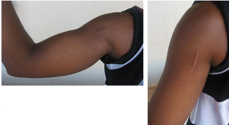
Figure 2 Clinical photographs showing post-operative scar from open tenodesis and resolution of cosmetic deformity.

windmill, remains incompletely understood. However, because of the uncertainty regarding the exact role of the LHB in these elite athletes and the potential adverse impact on throwing ability, there has been a general reluctance to treat biceps pathology with tenotomy or tenodesis.